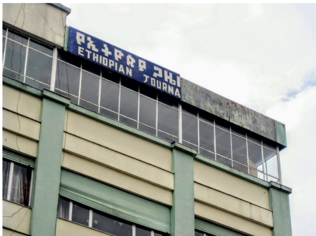
The government-loyal Ethiopian Journalists Association is struggling while new regional associations are being formed.