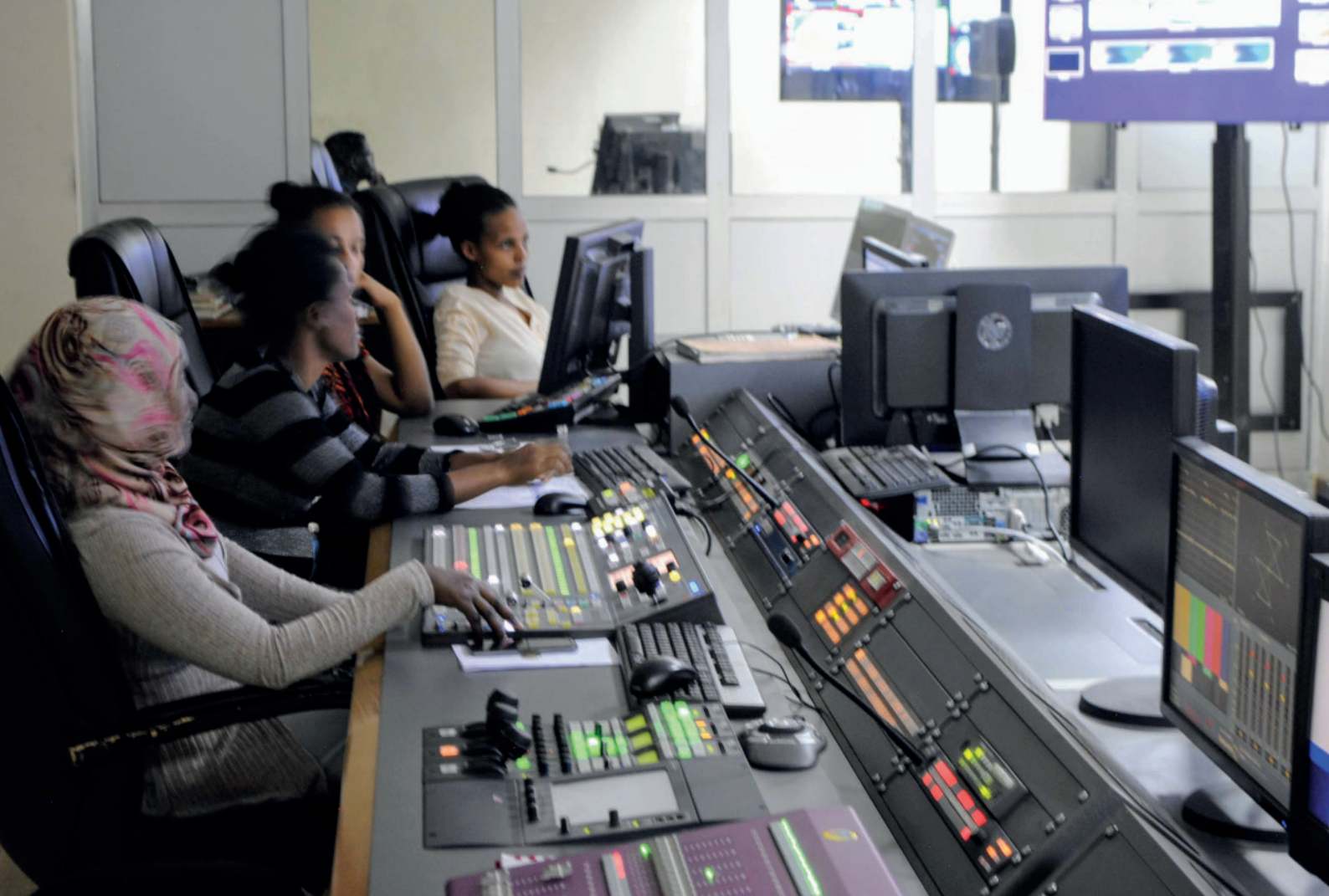
Master control room, Amhara Television, Bahir Dar.