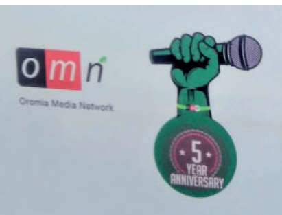
Above: OMN began as a 'struggle medium' in 2014, but now claims to take on a new profile.