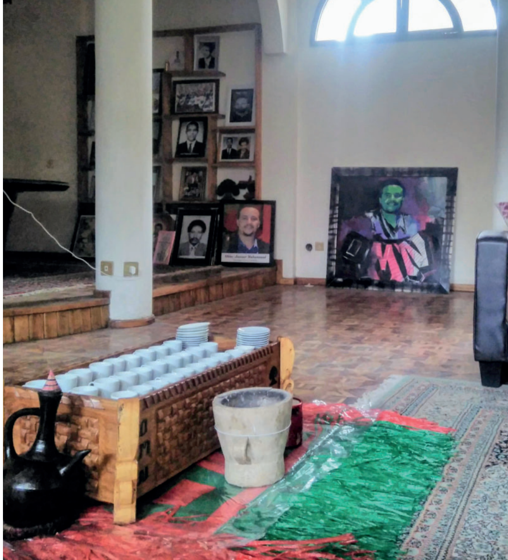
Right: A painting in Jawar Mohammed's reception room portrays him as the personification of OMN.