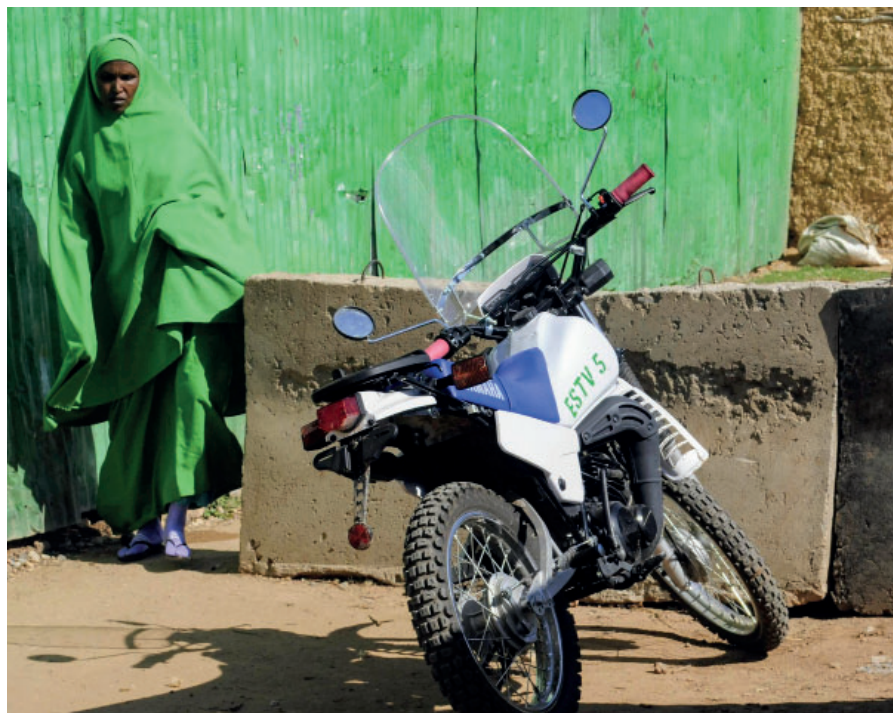
Below: A reporter's vehicle parked outside of the headquarters of Ethiopian Somali Television (ESTV) in Jigjiga. ESTV is part of the Somali Regional State Mass Media Agency.