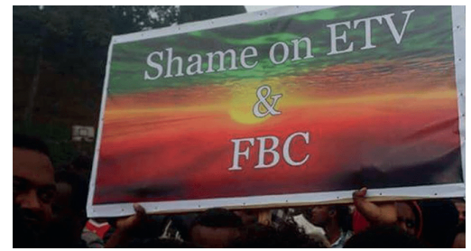
ETV (EBC) and FBC were targeted in the protests in Gonder in 2016.

Amidst the attention given to the reconfiguration of the media landscape in the central parts of the country, the changes in the media situation in the far north could easily be disregarded. However, the development in the Tigray-affiliated media since 2018 quite markedly captures some of the major tendencies in local media governance. It also demonstrates how media, politics and ethnicity are deeply intertwined in the Ethiopian