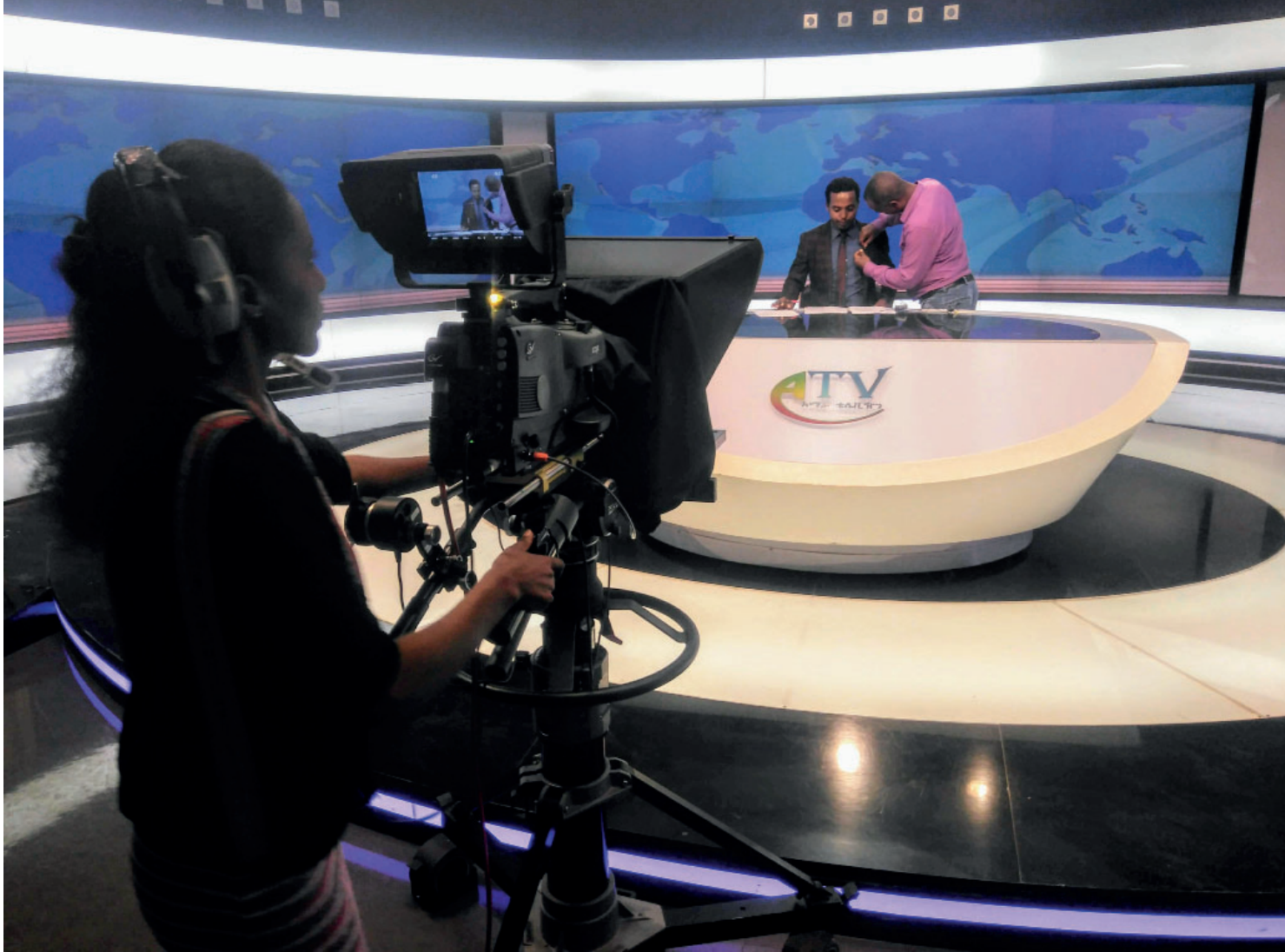
Above: Amhara Mass Media Agency in Bahir Dar has highly advanced studios and a helicopter landing pad on its premises.