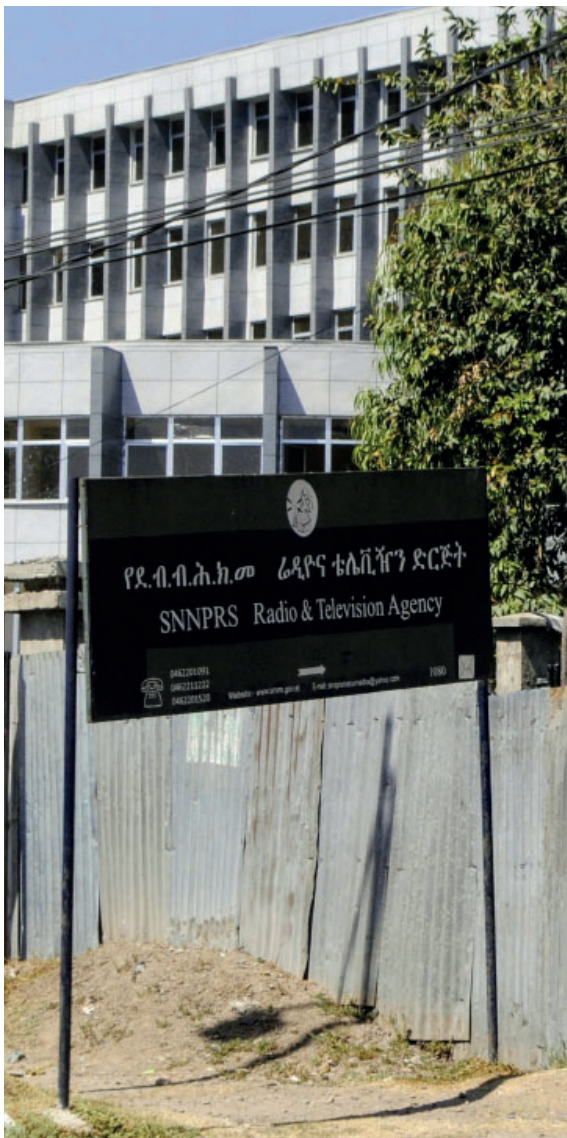
Left: The Southern Nations, Nationalities and Peoples' Region Radio and Television Agency in Hawassa, popularly called South Radio and TV, produces content in no less than 49 languages every day.