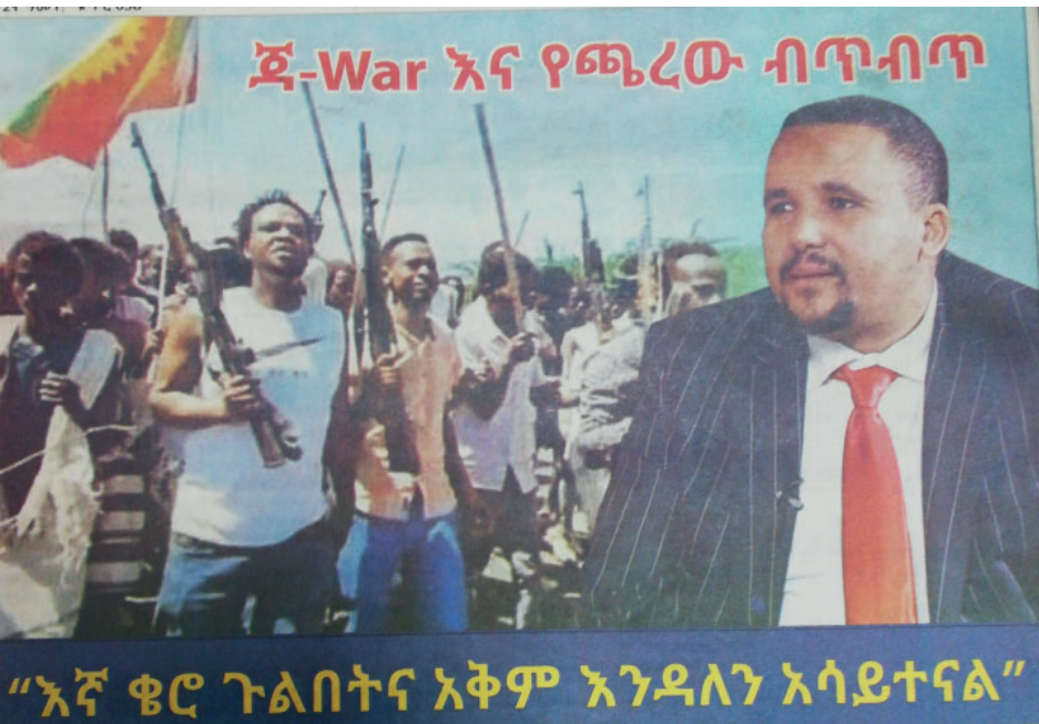
Facsimile of Ethiopsis from October 2019, showing the loyalty of Oromo young men ( qeerroo ) to Jawar Mohammed.