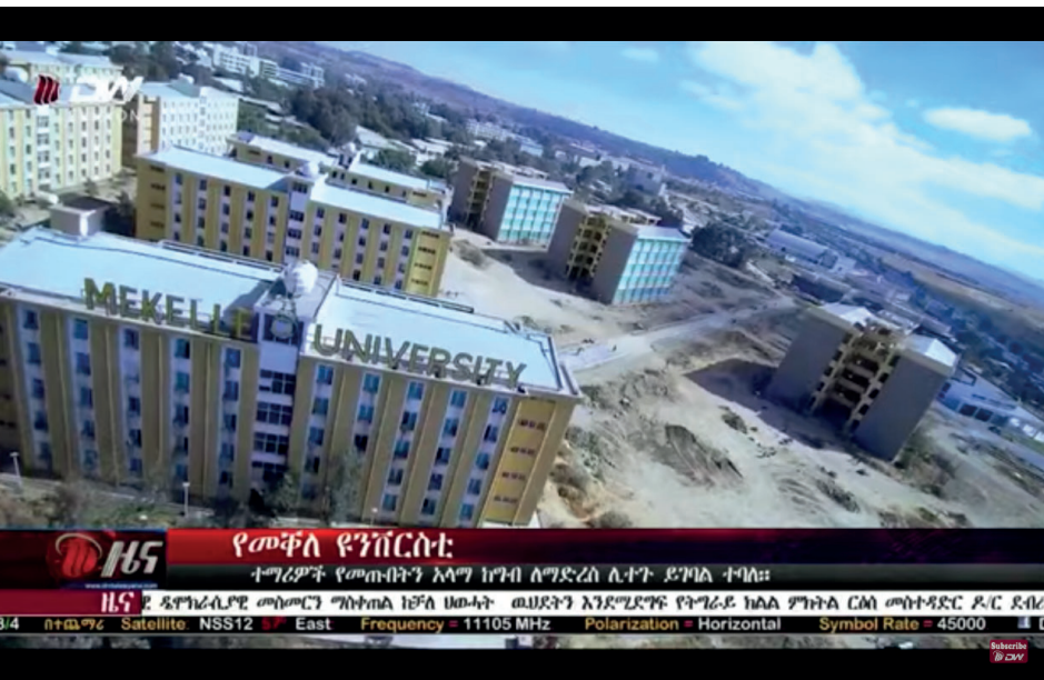
A report on DWET showing how Mekelle University is a convenient place for students coming from other parts of the country.